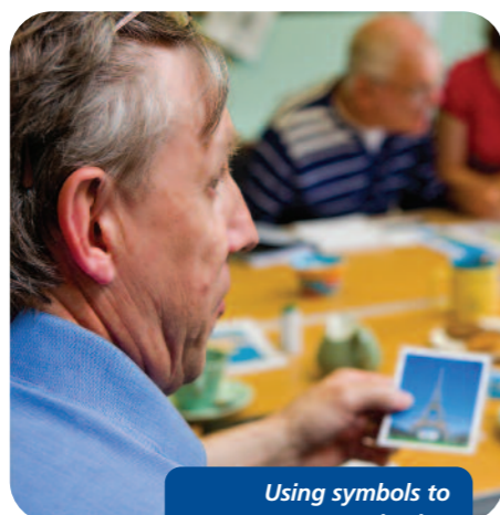
Using symbols to support communication