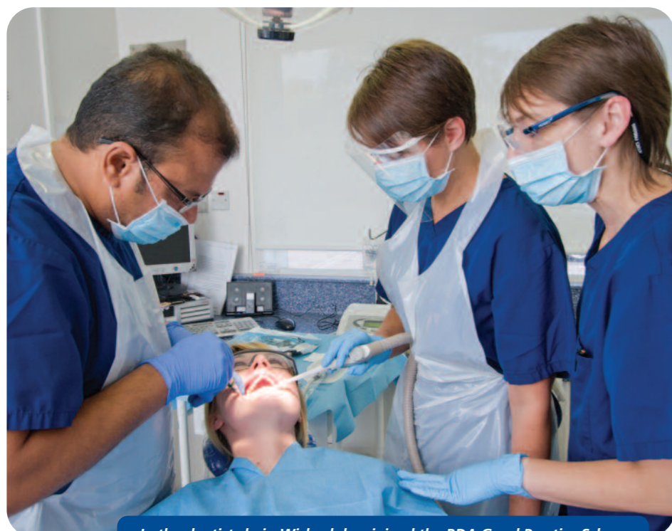
In the dentist chair: Wisbech has joined the BDA Good Practice Scheme

If you would like more information about the Dental Access Centres please contact Cambridge Dental Access Centre on 01223 723093, Huntingdon Dental Access Centre on 1480 363760, Wisbech Dental Access Centre on 01945 465919, or Peterborough Dental Access Centre on 01733 295854.