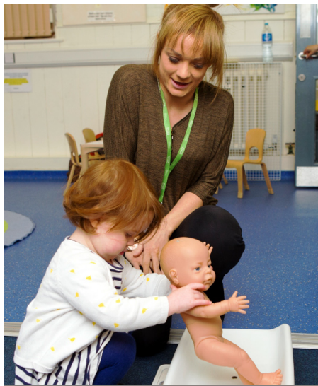
Turning Two Party at Dereham

teams will deliver training to practice nurses throughout July and August 2016.