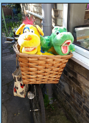
Magic the dragon and Roo the kangaroo

"This is a preventative driven approach aiming to reduce the amount of people needing dental treatment. So if the oral health messages are getting through, it means that we don't