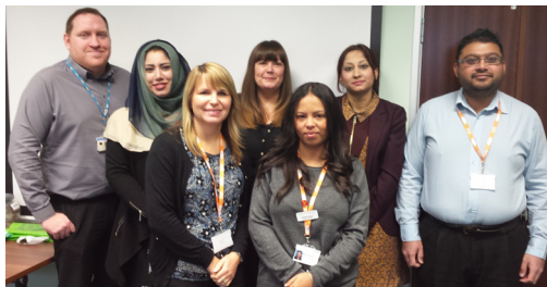
Our Luton based MDT Care Co-ordinators

We'll also continue to work closely with colleagues from Keech Hospice to ensure the integrated MDTs work collaboratively with the hospice's My Care Coordination Team which co-ordinates services for palliative care patients and their families.