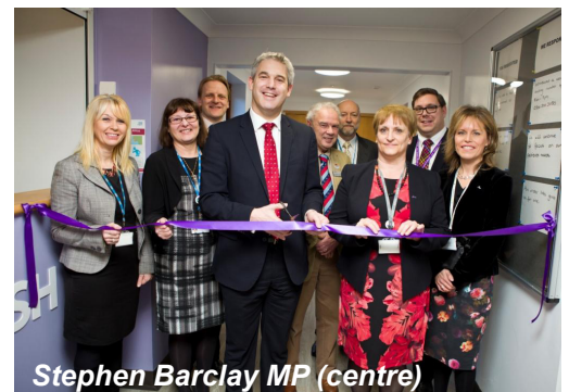
Stephen Barclay MP (centre)

"We're delighted that we can bring the two together, so that patients are seen for both specialities during one appointment."