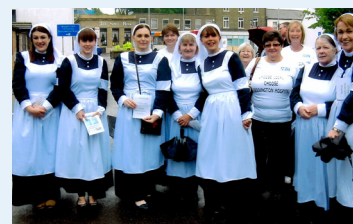
Staff in WW1 uniform

On Saturday the 13 June, Doddington outpatient department staff took part in the March Festival Parade – dressed as 1st World War nurses.