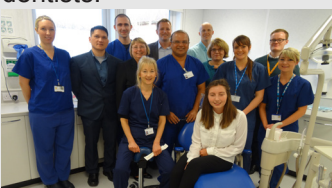
DAC staff with USAF 43rd Medical Squadron

The U.S. Air Force group met a wide range of staff from the Trust, for an in-depth look at the Dental Emergency Service and Special Needs work.