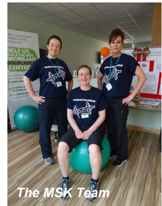
The MSK Team

promote physical fitness in the work place. Sedentary lifestyles can lead to ill-health, however we want to raise awareness that a short stretch or changing position every 20 minutes can vastly reduce problems such as musculoskeletal pains as well as heart problems and diabetes".